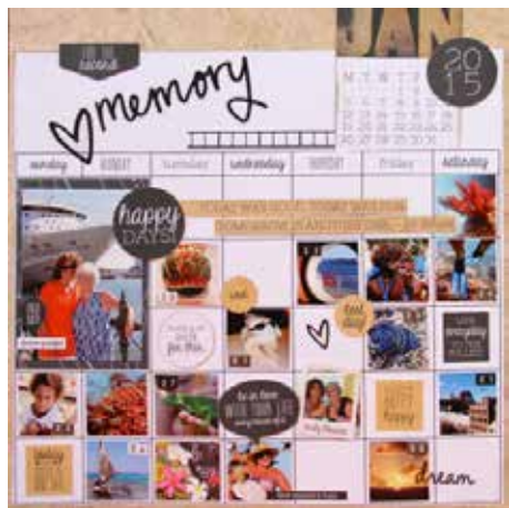
Paradiso class samples from 2014 cruise to South Pacific.

And YES you can get photos printed on board.