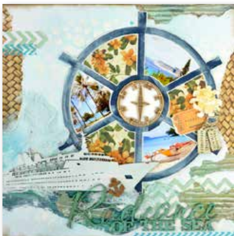
Album header - 2014

If you need to disappear to go play bingo or some other activity onboard you know that you can come back and catch up before the next class starts on the following sea day.